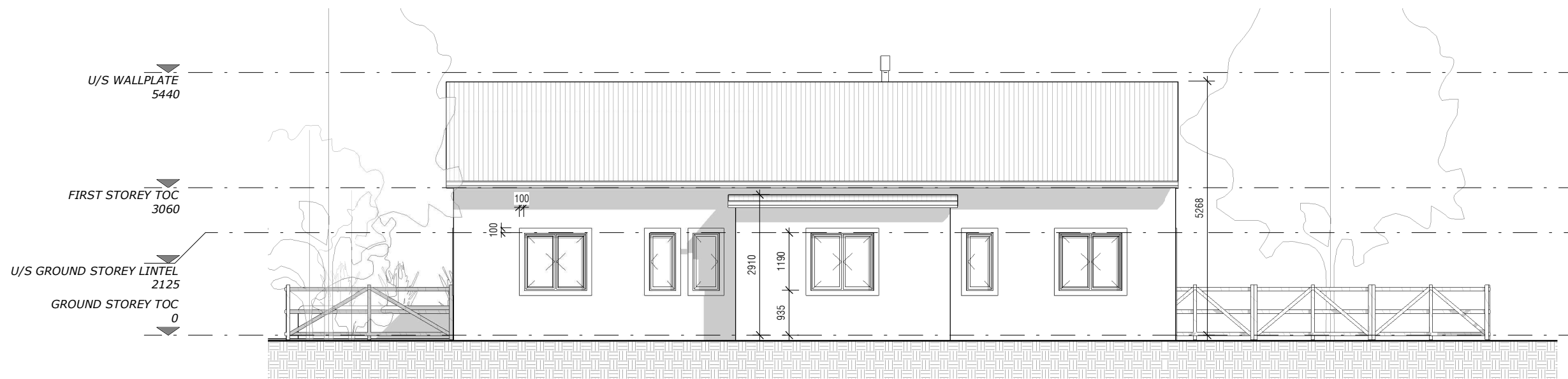
EAST ELEVATION SCALE 1 : 100