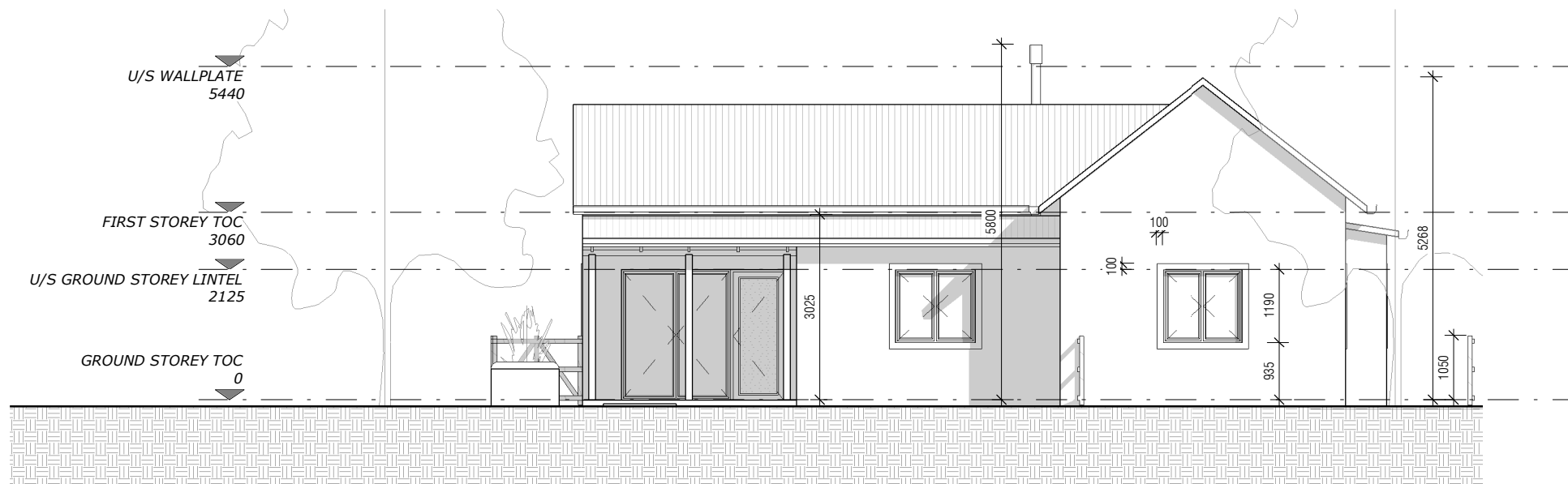
SOUTH ELEVATION SCALE 1 : 100